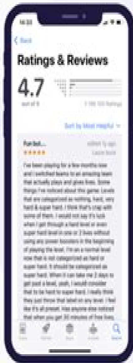
Ratings & Reviews section on product page on App Store