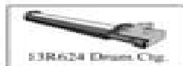
138624 Drum Chg.

Drum Cartridge: Replacing the "Print Cartridge" (138624) or the Connector CRUM (Customer Replaceable Unit Monitor) on the underside of the front end of the cartridge will reset the drum counter. The cartridges for the previous models are physically extremely similar however the CRUM being different makes them not interchangeable. Reconditioning these cartridges is possible thanks to the fact that they use the same Drum, Blade, & Charge Roll as the C32's etc, which came before them.