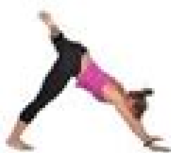
Knee Circle (step 1)