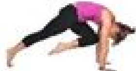
Knee to Nose