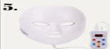
LIGHT THERAPY MASK