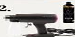
SPRAY TAN MACHINE