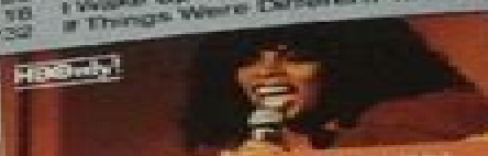
HBO Rocks Donna Summer