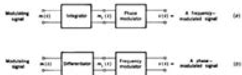
Figure 4.3-1 Illustrating the relationship between phase and frequency modulation.