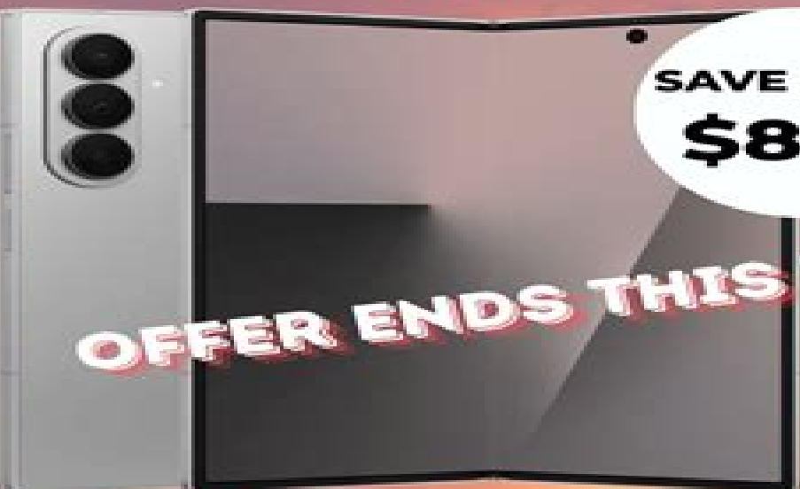
Galaxy Z Fold7