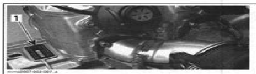
TYPICAL — 500SS AND 600 HO SDI ENGINES 1. Engine serial number