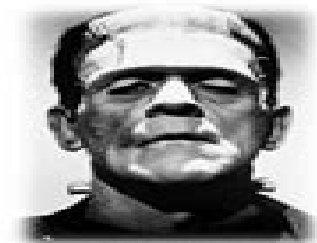
From Frankenstein (1923) played by Boris Karloff