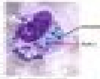
Micrograph showing a large, dark, oval-shaped organism, likely a parasite, against a lighter background.