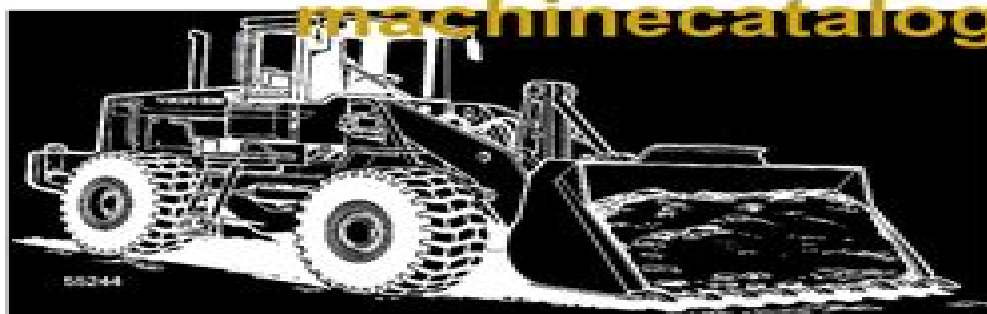
Figure 1 Loader L150

The steering system is hydrostatic with a variable load-sensing axial piston pump and two hydraulic cylinders (steering cylinders). Hydraulic system, see [invalid linktarget].