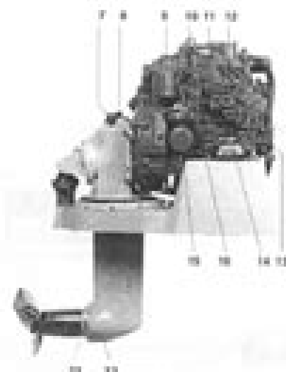
MD2010B & MD2020B