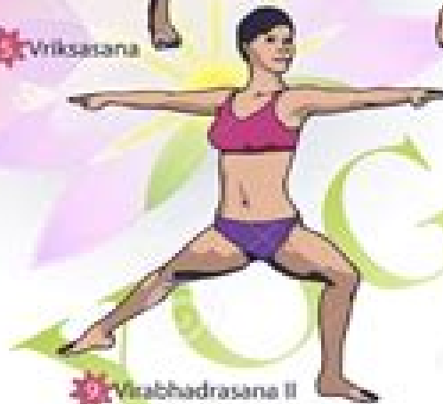
✿ Virabhadrasana II