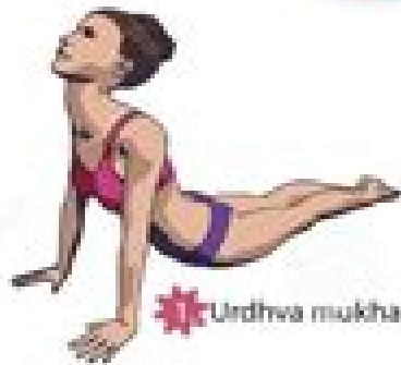
✿ Urdhva mukha svanasana