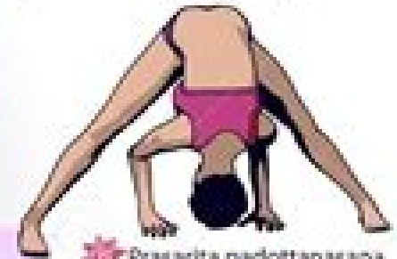
✿ Prasarita padottanasana