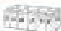
Simple Columnar Epithelium