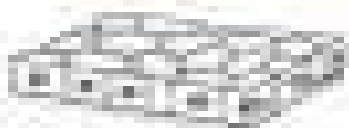
Simple Cuboidal Epithelium