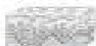
Simple Squamous Epithelium

Identify each type of epithelial tissue and its function. (You may use the following as a guide.)