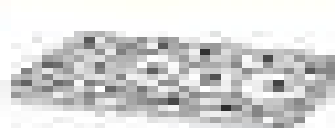
Simple Squamous Epithelium

What is the function of the epithelial tissue? (You may use the following as a guide.)