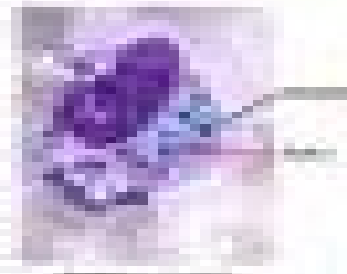
Microscopic image of a parasite.

Parasitology is the study of parasites, which are organisms that live on or inside other organisms (hosts) and derive nutrients at the expense of the host. Parasites can be unicellular (like protozoa) or multicellular (like helminths). They cause various diseases in humans and animals, and understanding their life cycles and transmission is crucial for effective treatment and prevention.