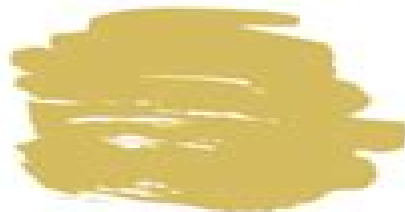
Cadmium Orange Hue