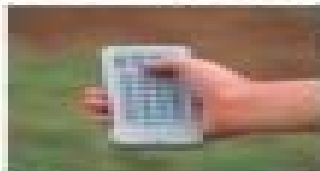
44 * Not included in the SGT10000.

This wireless keyboard has a total of 37 keys, including alphanumeric keys, function keys, and measurement controls, to enable quick and easy data entry of point names and coordinate values.