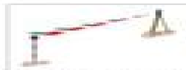
It shows flashing position to other observer. It shows when both sides are flashing.