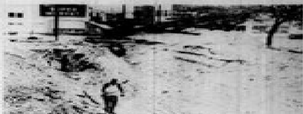
First Baptist Church