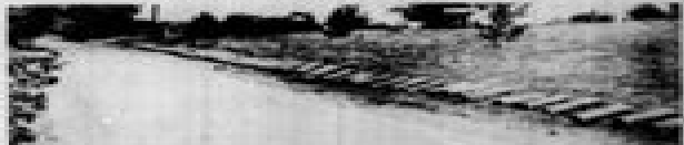
More City Sewer Lines

Construction progress is being made on the city sewer lines. The city is planning to build more sewer lines to improve the city's sanitation.