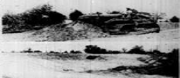
Lakenhill Leveling Work