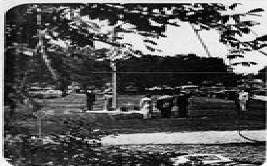
REMEMBERED — Veterans were held in Oak Hill Cemetery in Smithville and throughout the county Friday, November 11, in remembrance of the fallen.

The audit also states that it is legal to operate a mobile home which has a minimum of 100 square feet of living space.