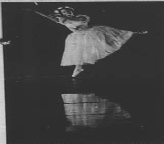
Chatterbox, a member of the Dallas Ballet performs in a contemporary dance piece in the Brownwood Bulletin. The company, which opened its first tour with the New Year