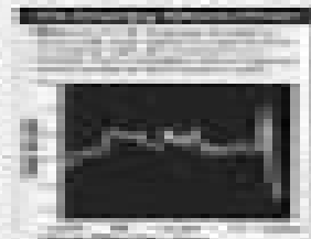
PG Energy Stock Performance

PG Energy's oil well has been experiencing significant difficulties, leading to a sharp decline in the company's stock price. The well, which was expected to produce a large amount of oil, has been plagued by a series of problems, including equipment failure and low production levels. This has left investors concerned about the company's future prospects.