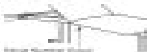
Motor Control System

• Adjustable table height/tilt/rotation • Motor control system