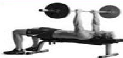
Flat Barbell Bench Press