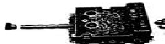
Fig. 10-36 - Multi-function Block with Servo Pressure Supply Shuttle Spool