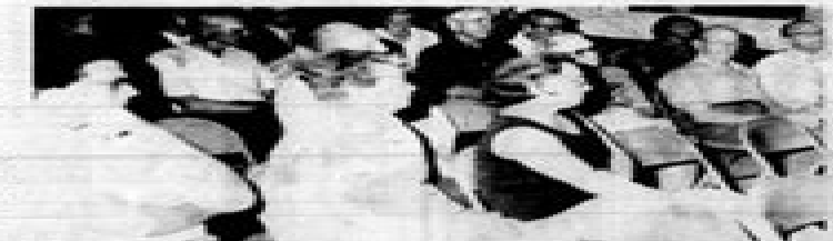
Students attending a lecture at the [Location].