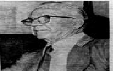
Portrait of [Name], [Title], [Organization].