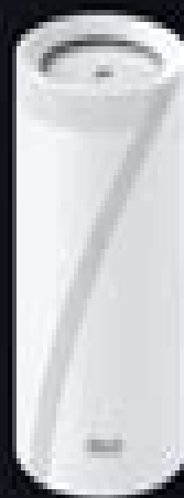
Deco Whole Home Mesh Wi-Fi 7