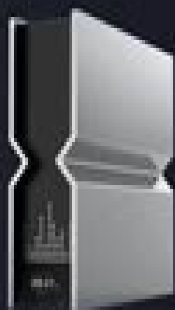
Wi-Fi 7 Routers