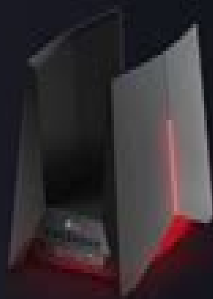
Wi-Fi 7 Gaming Routers