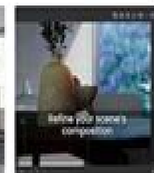
Refine your scene's composition