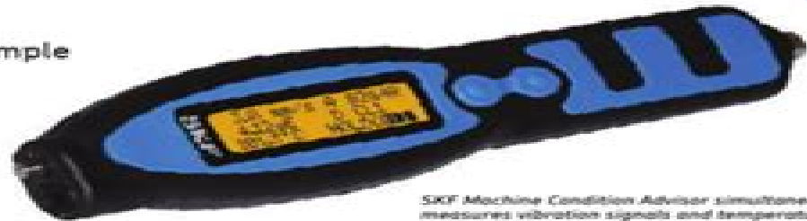
SKF Machine Condition Advisor simultaneously measures vibration signals and temperature to indicate machine health or bearing damage.

Now both novice users and experts can easily, quickly, and accurately check the condition of rotating equipment throughout your facility. Equipping your maintenance and operations personnel with this rugged, ergonomic and easy-to-use instrument can provide early warning of potential machine problems before a costly failure occurs.