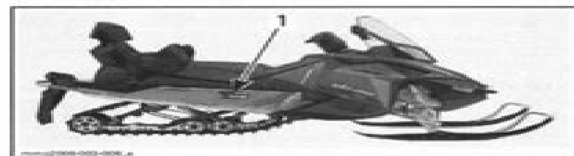
TYPICAL 1. Vehicle identification number