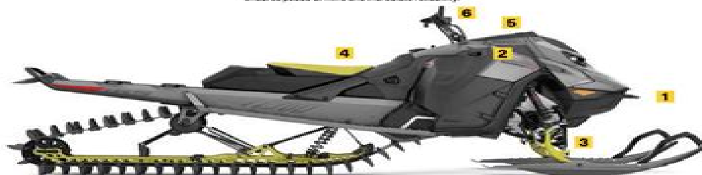
COMMIT X 185 850 E-TEC TURBO R SNOWS

Highest-quality KYB high pressure gas front shocks with an updated lighter weight design. Rebuildable and rethreadable.