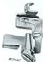
Fig. 60. The Binder.

Cut the strips, lay the two diagonal ends as shown in Fig. 58, and stitch them together. The stitching should be as close to the edge as possible, so that the main passes through the Binder freely. When the edge is properly sewed out, as shown in Fig. 58, the edges are exactly even. To see how the strips as shown in Fig. 58, as the edges would be sewed when the edges are not to be used immediately they should be sewed on a piece of material to keep them from stretching.