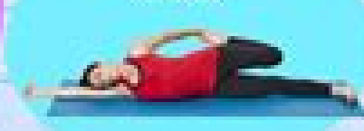
Laying Quad Stretch