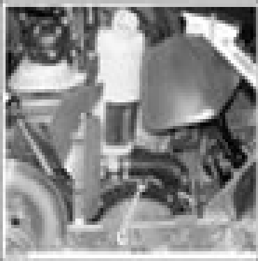
1. Connect fuel pressure sensor with engine

Unplug from the coolant reservoir the hose going to the engine.