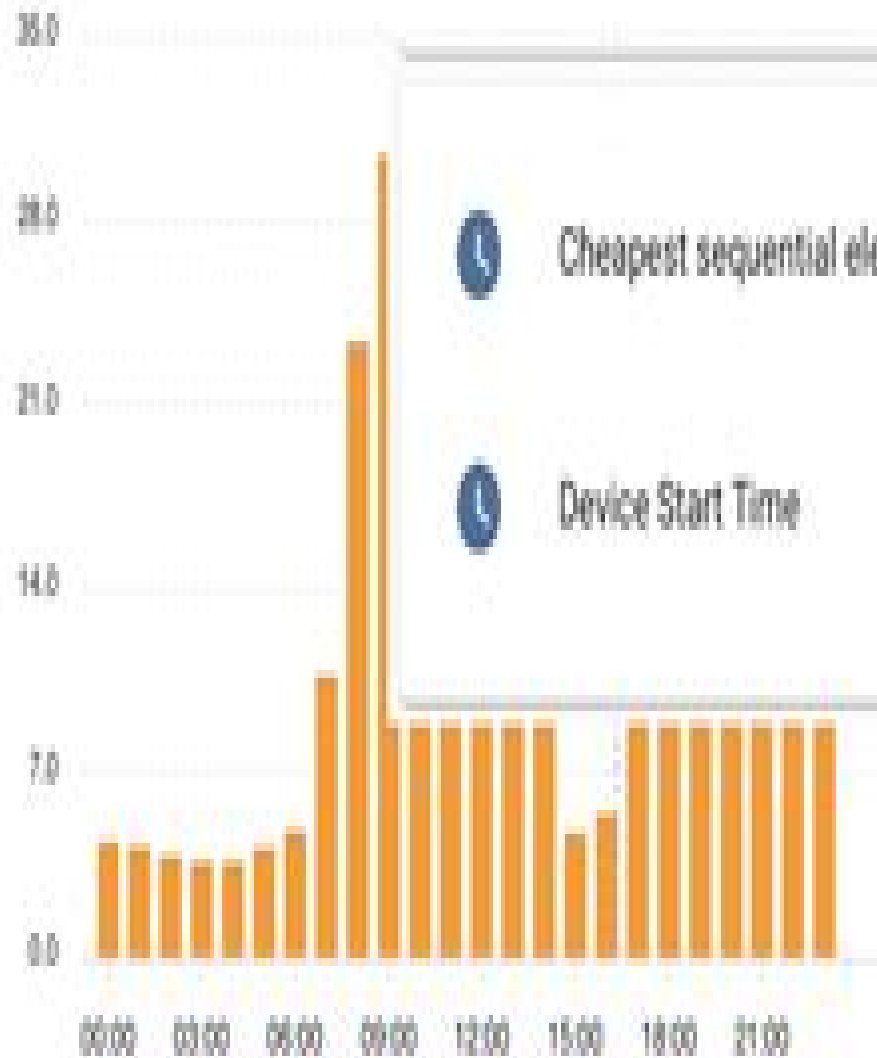
Energy price today (amt/kWh)