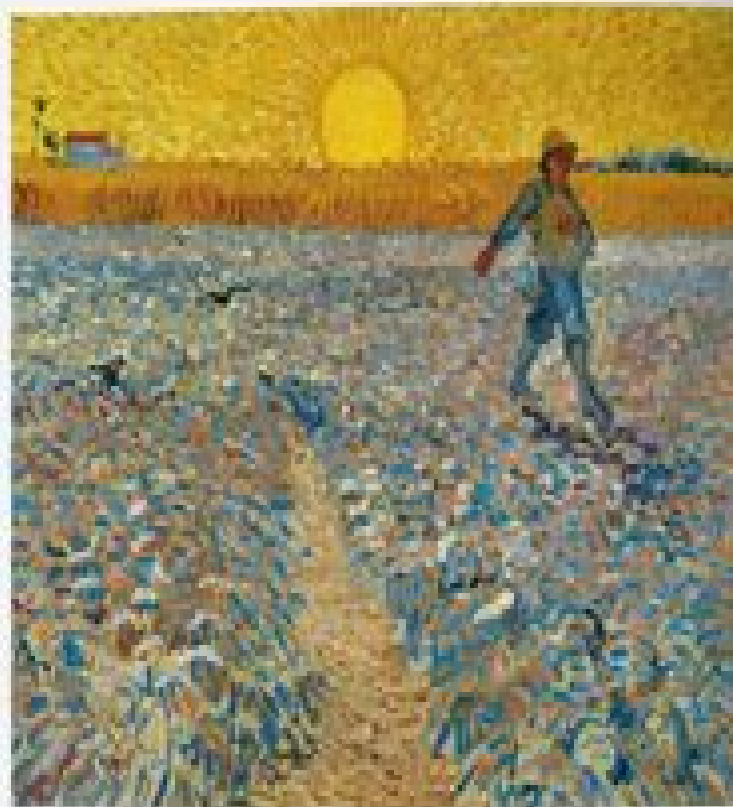
The Sower 1850, oil on canvas The Tate Gallery, London