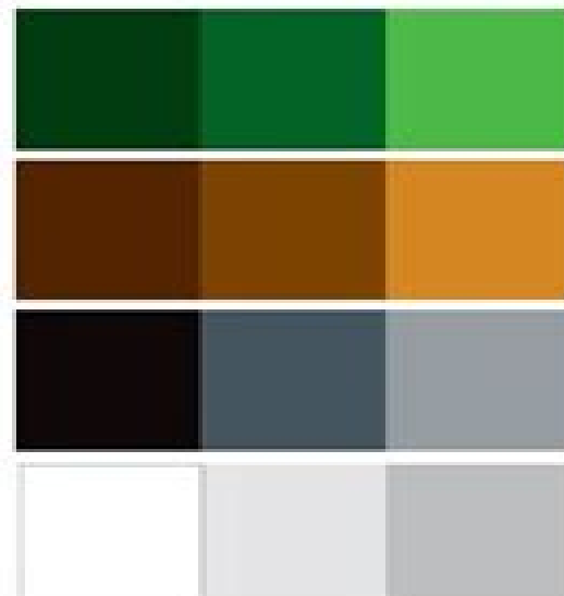
Secondary colors – moderate use

NFL White 1 (NFL Shield White) video R255 G255 B255