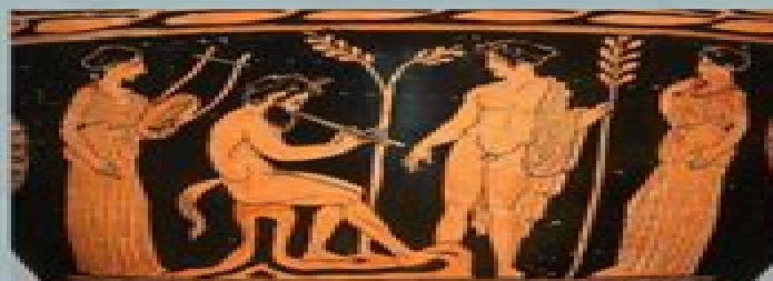
Music in Ancient Greece

In Greece, music was an important part of ancient Greek theatre. Their choruses sang for entertainment, celebration and spiritual reasons. There were wind and string instruments like the lyre and kithara. Music was an important part of education in ancient Greece, and boys studied music starting at age of six.