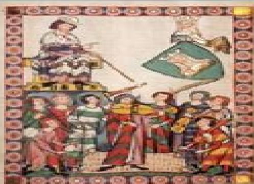
Musicians in the Middle Ages.