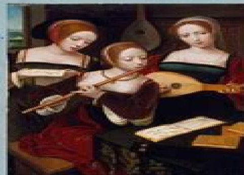
Music in the Renaissance.

Much of the surviving music of that time are special songs from troubadours like ballades... (narrative poems or songs about medieval adventures and romances). Troubadours also played different instruments.