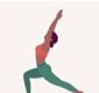
Warrior 1 Pose