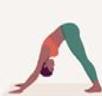
Downward Facing Dog