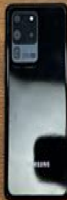
Galaxy S20 Ultra