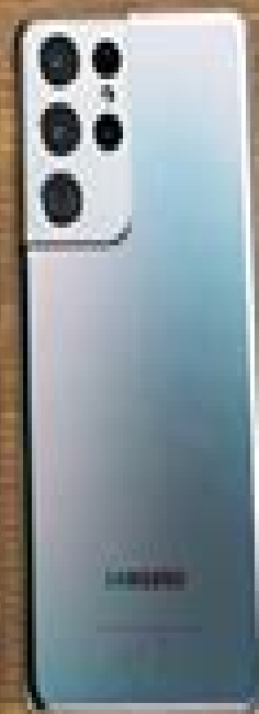
Galaxy S21 Ultra