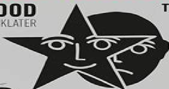
SUNSET BOULEVARD BILLY WILDER