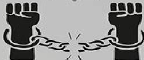
THE SHAWSHANK REDEMPTION FRANK DARABONT