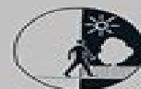
IT'S A WONDERFUL LIFE FRANK CAPRA