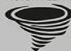
THE WIZARD OF OZ VICTOR FLEMING