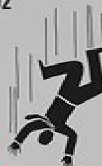
VERTIGO ALFRED HITCHCOCK