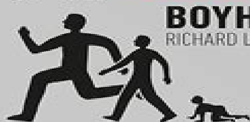
BOYHOOD RICHARD LINKLATER