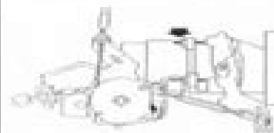
Schéma de montage de la boîte d'engrenage