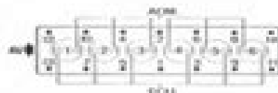
Schéma de montage de la culasse et disposition des cylindres et des soupapes

Cylindrée : 5,24 l. Cylindrée : 5,24 l. Cylindrée : 5,24 l. Cylindrée : 5,24 l. Cylindrée : 5,24 l. Cylindrée : 5,24 l.