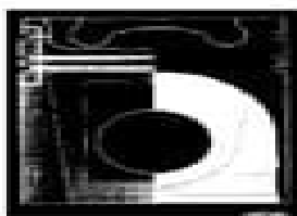
Figure 1 Piston for TD61-GD (principle diagram)