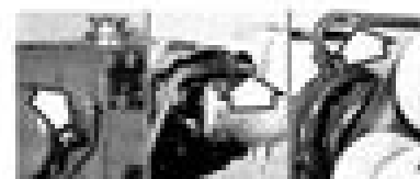
Venting valve, TAD150C

When there is a risk of freezing the system must be drained or anti freeze should be added, see "Precautions in case of freezing" on page 5.