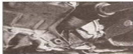
Gearbox oil can leak from the seals at the inboard ends of the driveshafts.