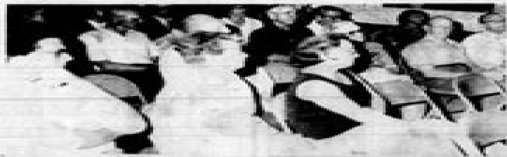
A group of seniors attending a meeting or presentation.