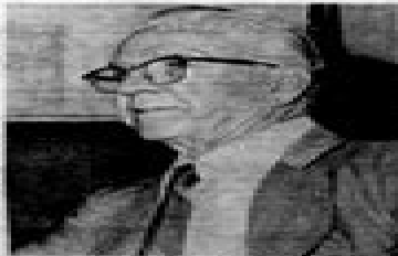
Director of the Learning Institute, [Name].