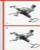
SCALED HILL PULL