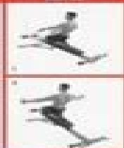
BACK DOLLOPS BENCH