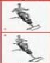
SCALED BRACE PULL