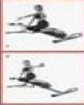
CROSSOVER PULL FEET UP