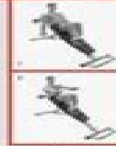
FRONT DOLLOPS BENCH