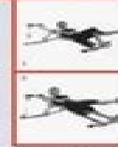
ONE LEG BOAT