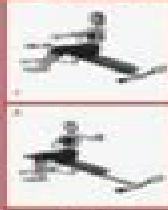
CROSSOVER PULL FEET DOWN