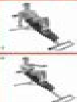
FRONT DELTOID RAISE