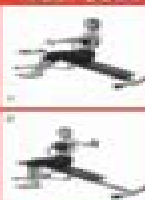
CROSSOVER PULL FEET DOWN