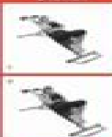
PULLER AS CROUCH