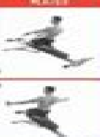
REAR DELTOID RAISE