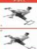
SHOULDER HIGH PULL