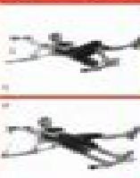
ONE LEG SPURT