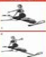
CROSSOVER PULL FEET UP