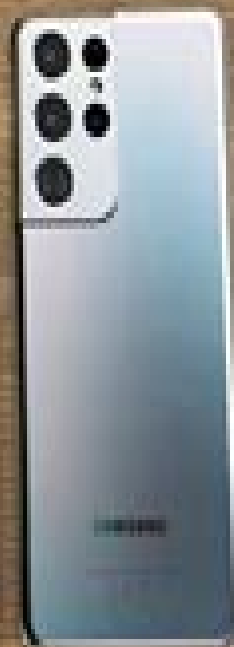
Galaxy S21 Ultra