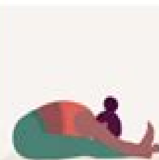
Seated Forward Fold