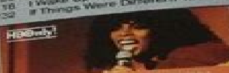
HBO Rocks Donna Summer